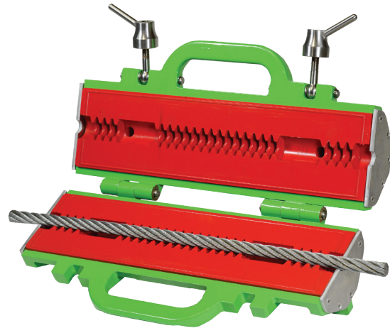
Mk II (8-67mm)